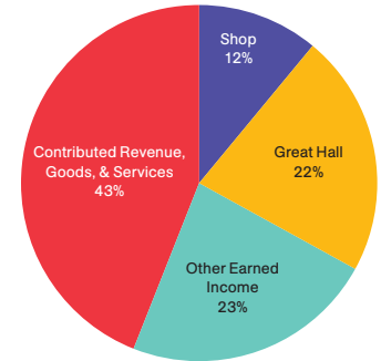
FY12 Sources of Support and Revenue